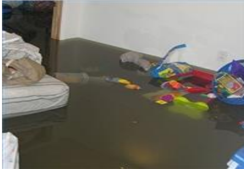
A Residential Sewer Backup