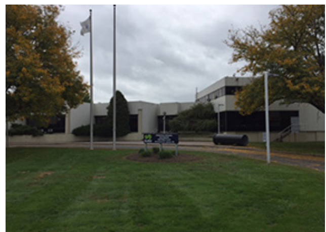
↑ Wastewater Treatment Plant Entrance (Tour Location)